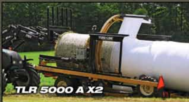
TLR 5000 A X2