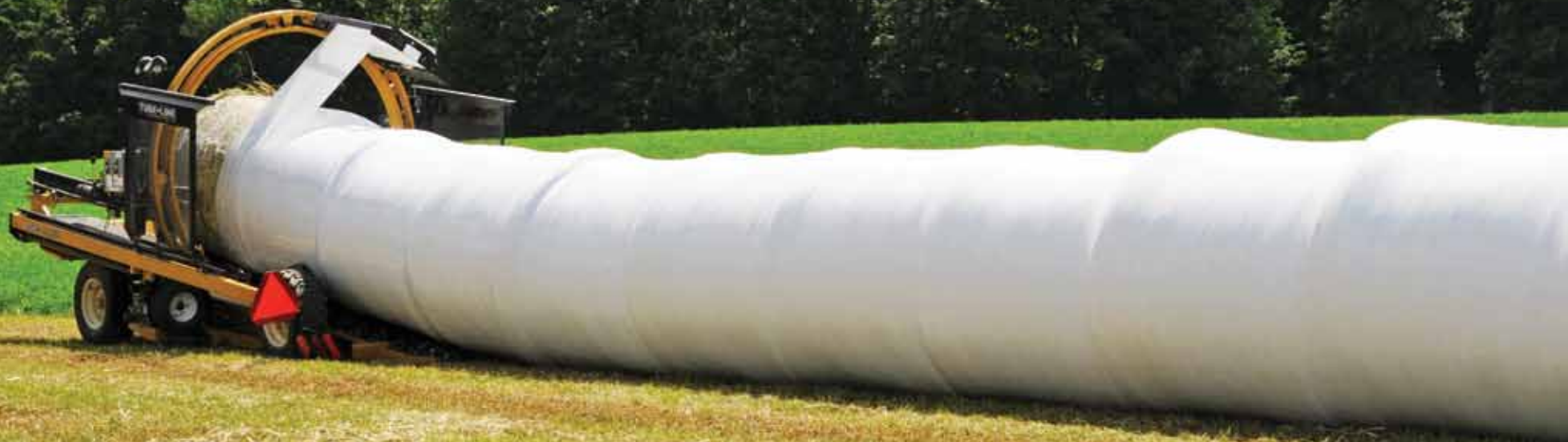
TLR5000 AX2 Model