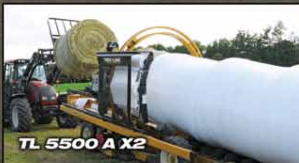
TL 5500 A X2