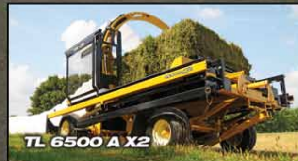
TL 6500 A X2