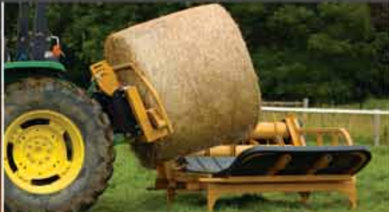
After loading the bale, the spear unit attached by sliding into the frame, creating a single carrying unit.