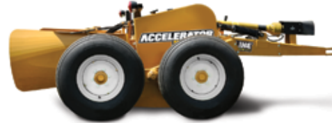
Lowered - Low ground clearance ensures no hay is missed

The Accelerator's easy operation conditions hay by simply running it through adjustable steel crimping rollers, up to 15 mph. This process cracks the hay stems without knocking off the leaves. Conditioning also fluffs the hay, allowing air to flow through the swath, for faster and more even drying from top to bottom. Speed up your operation with the Tubeline Accelerator producing better hay, faster drying time and bigger profits. Contact your authorized Tubeline dealer for more details.