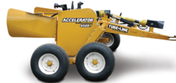
Raised - Transport Position